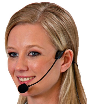
MIC-200SEN Interpreter Microphone