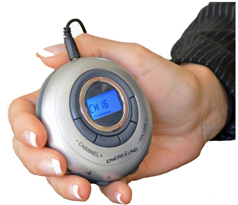
R-120 Multi channel FM Receiver