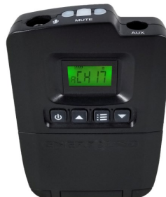
TP-600 Multichannel Battery-Operated Transmitter