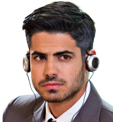
EAR-120 Dual Headphones

Limited lifetime warranty on receivers and transmitter. See manufacturer website for more details. 1-year warranty on headphones & microphone.